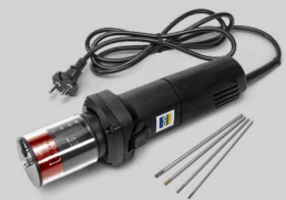
Tungsten electrode sharpener (Optional) 083721