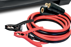
Supplied with cables (5 m - 25 mm 2 )