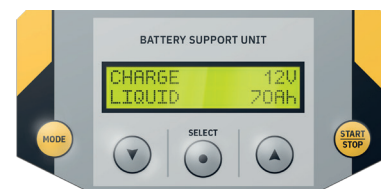
Intuitive interface available in 22 languages