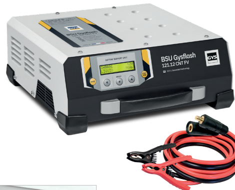
Supplied with cables (5 m - 25 mm 2 )