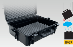
Carry case 060432