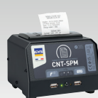
Smart Printer Module 026919