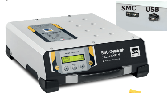
Supplied with cables