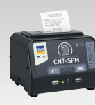
SPM : Printer module 026919