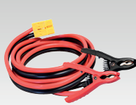
8 m - 16 mm 2 056572