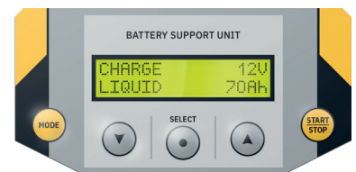
Intuitive interface available in 22 languages