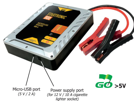
Micro-USB port (5 V / 2 A)