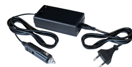
Charger 12 V / 2 A DC (ref. 054684)