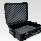
On-Site Case IP67 060432