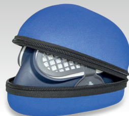
Storage case 037045