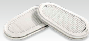
2 spare filters FFP3 037038