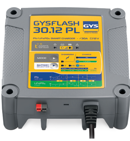
✓ START / STOP (EFB/AGM)